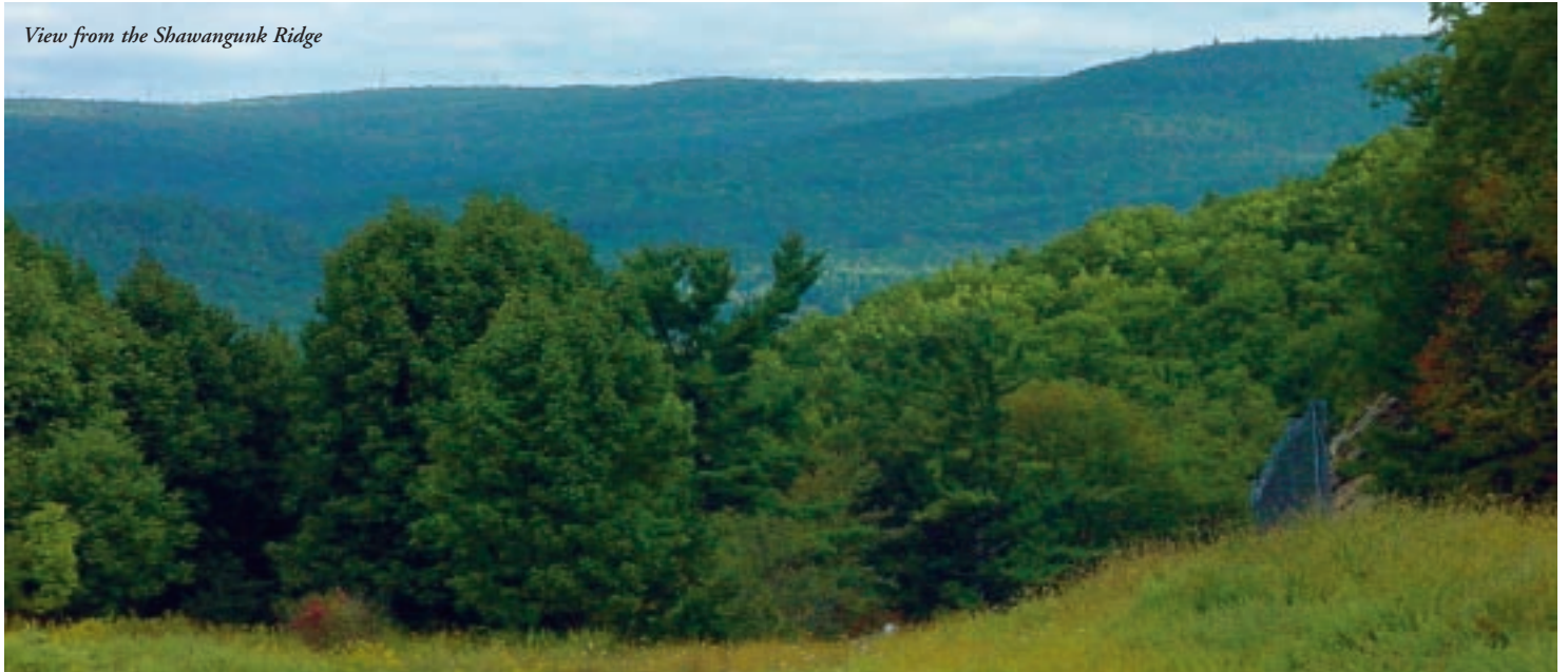
View from the Shawangunk Ridge